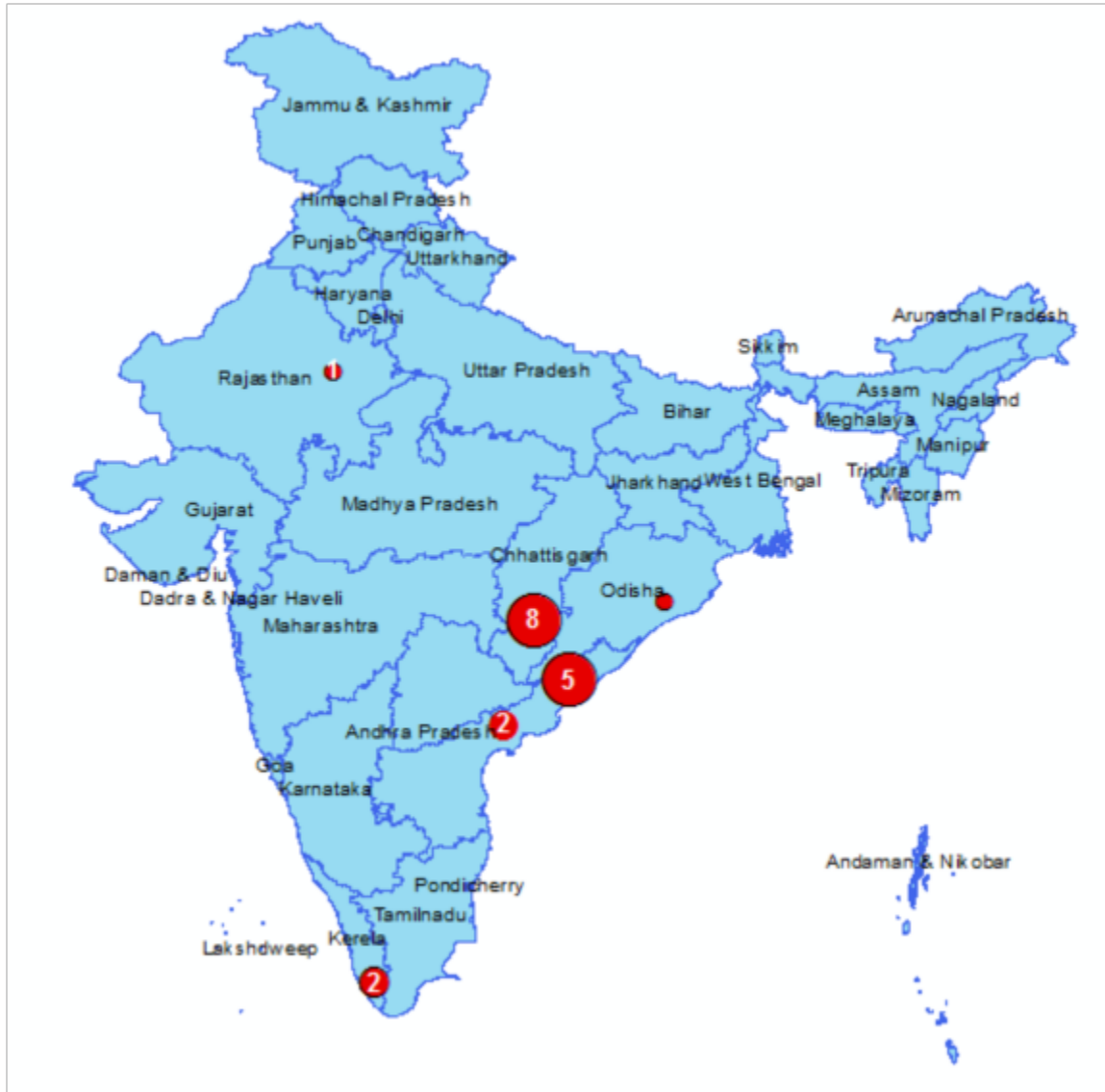
Fig 3: Map showing suspected outbreaks of dengue diagnosed by VRDLs, 39 th week of Sep 2016