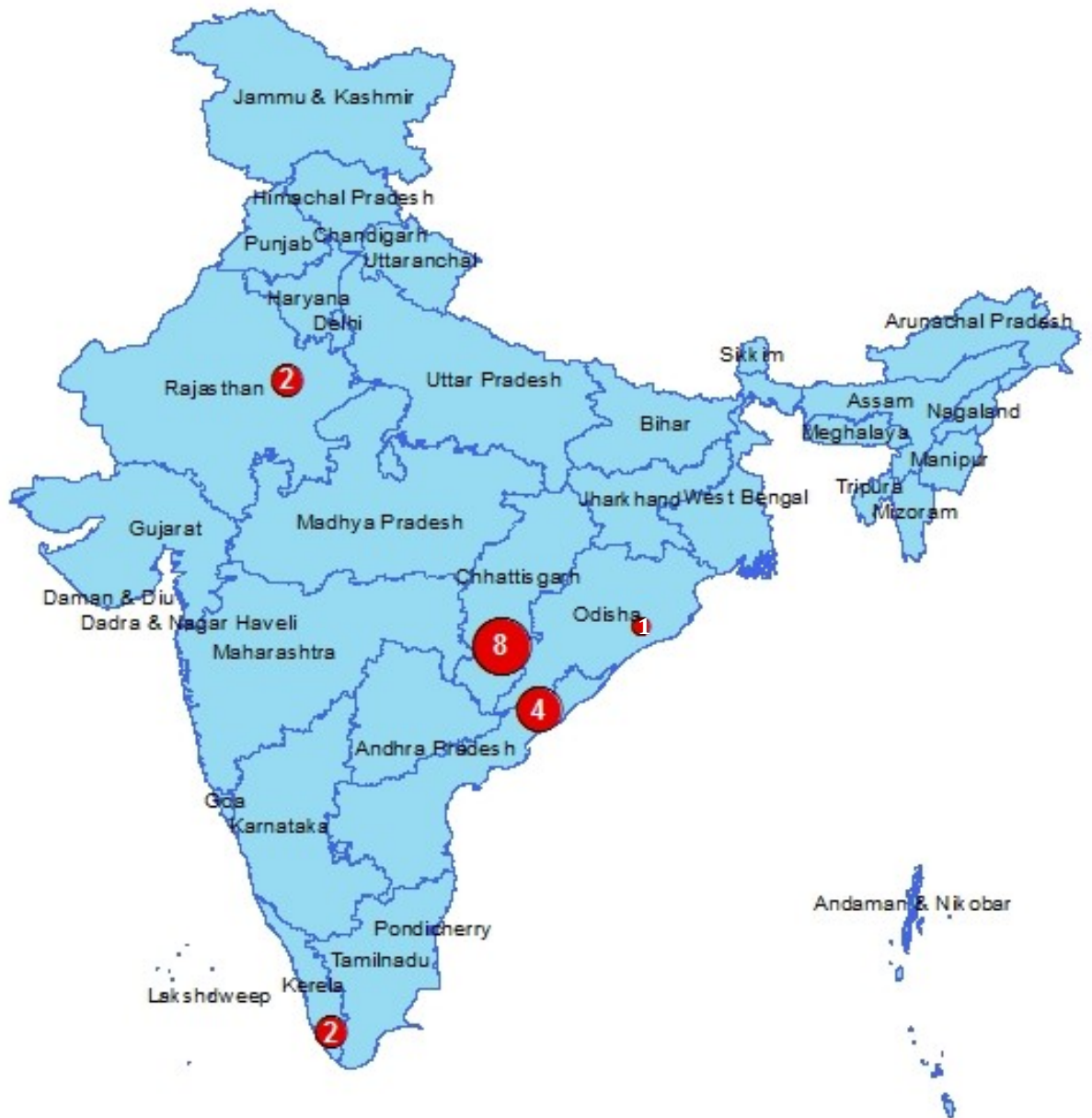
Fig 3: Map showing number of suspected outbreaks of dengue diagnosed by VRDLs, Jan-Sep 2016