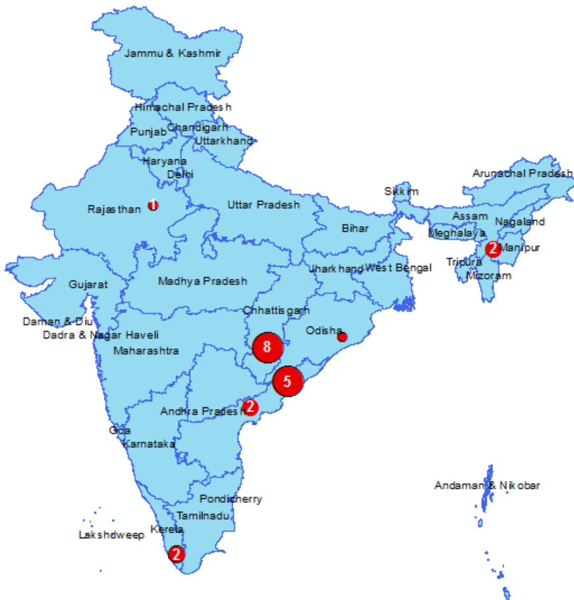
Fig 3: Map showing suspected outbreaks of dengue diagnosed by VRDLs, 45 th week of Nov 2016